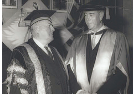
Sir Roden Cutler & The Hon. Gough Whitlam