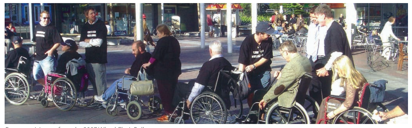
Eager participants from the 2007 Wheel Chair Roll