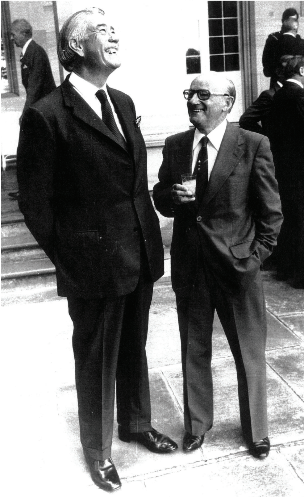
Sir Roden Cutler and Sir Donald Bradman.